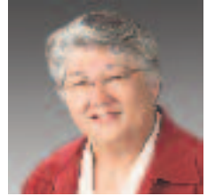
Charmaine Tavares Mayor, Maui County